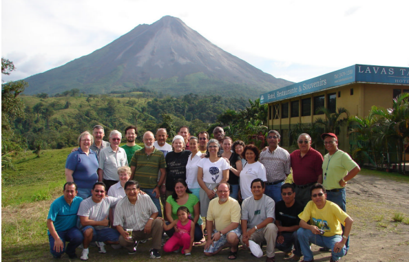
PRODOLA students and faculty meeting in February, 2010, with Arenal, one of Costa Rica's active volcanoes, in the background.